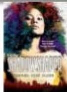
Shadowshaper by Daniel Jose Older