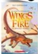
Wings of Fire Series by Tui T. Sutherland