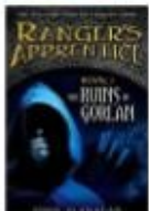
The Ranger's Apprentice Series by John Flanagan